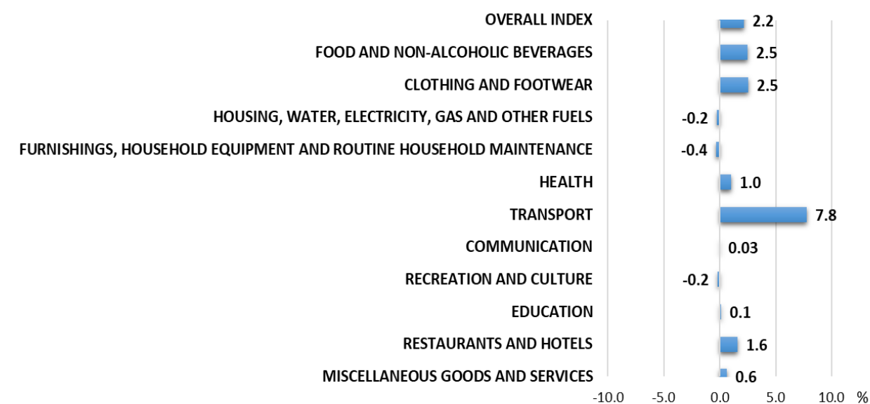
CPI Month-on-Month Changes in August 2021